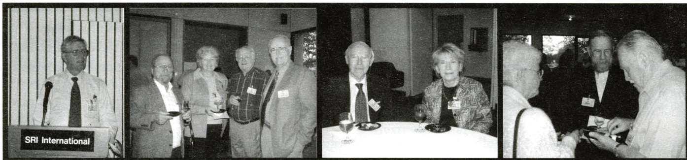
MC Boyd Fair