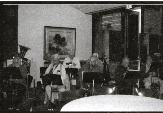
Thank You Institooters