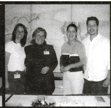
Credit Union Staff Members Provided Champagne for the Event

Some 145 alumni and friends gathered on October 29 to greet old friends, tap toes to the Institooters, and enjoy hot and cold hors d'oeuvres and champagne. The photos here (all by John Leung) show the celebrants in all their finery.