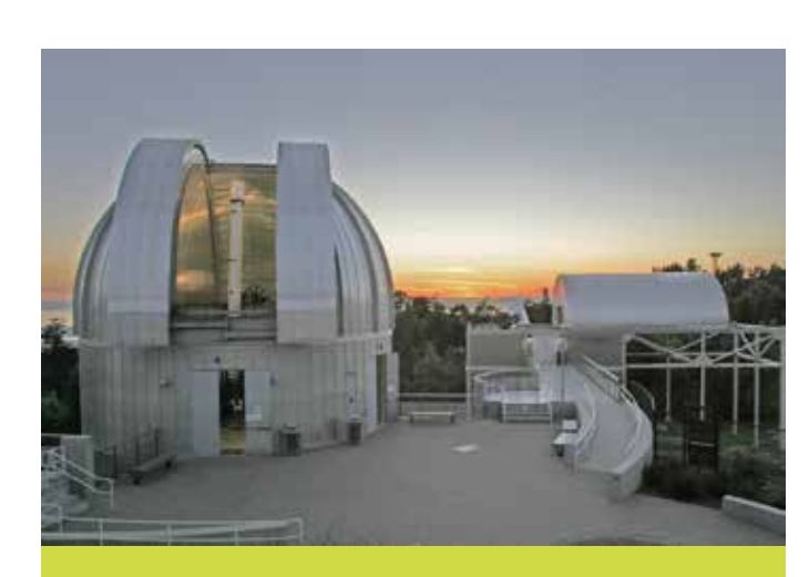
The Spring Fling is May 14, 2014, at the Chabot Space & Science Center. See announcement on page 11. The flyer for this event is enclosed with this mailing.