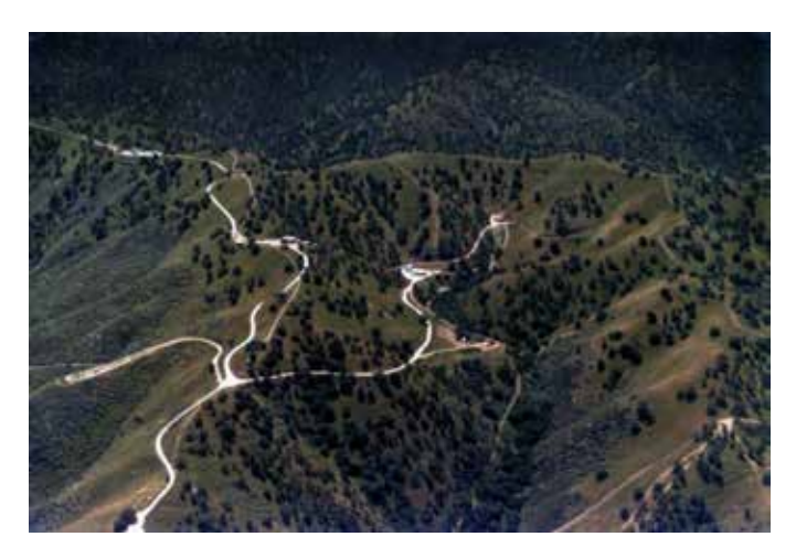
Aerial view of SRI's Corral Hollow Experiment Site (CHES).

Because surrounding development encroached on the leased Calaveras Test Site, SRI purchased the Corral Hollow Experiment Site (CHES) in 1970. In the early days at CHES conditions were primitive compared with Calaveras. Power came from diesel generators that required constant maintenance. Outdoor toilets and poor roads were the norm. In spite of these drawbacks, excellent experimental work was performed and site development proceeded. PG&E power came in 1975, and the roads were improved steadily. Poulter Lab has continually added new test facilities at CHES.