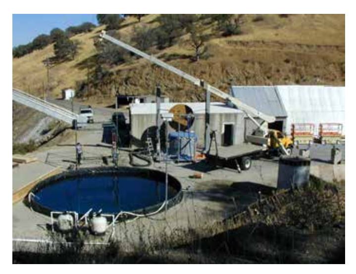
CHES Area 2 with underwater test facility.

When the Cold War ended, the support for nuclear-related work dropped off dramatically. We scrambled hard to get support in other fields, particularly in conventional weapons effects. DTRA [Defense Threat Reduction Agency] (formerly DNA) continues to be a major client, but now the work is on conventional weapons effects in tunnels. Various missile agencies have sponsored Poulter Lab to determine critical loads to defeat target missiles. The Army and Navy have sponsored the lab in investigating problems related to defeating mines and in clearing obstacles from the beach and surf zone. Two small test pools were built at CHES to support these programs. The original pool was replaced with a new large pool that is 30 feet in diameter and 20 feet deep. The new pool is used for testing submarine models, for investigating underwater mine lethality, and for underwater test launches of Navy missile systems. The lab also created an arena test bed for studying fragmentation of bombs at Area 1.