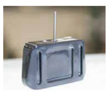
SRI's proof-of-concept for a conformable natural gas storage tank.

under the ARPA-E Methane Opportunities for Vehicular Energy (MOVE) program. BlackPak was cofounded by SRI, InnerProduct Partners, and ATMI, Inc. It is leveraging technology developed and spun out from SRI as part of a prior award under the MOVE program.