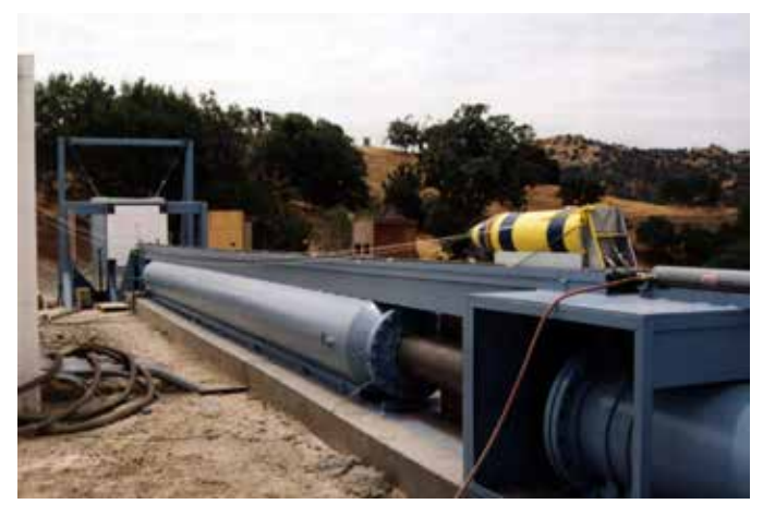
CHES Area 3 with gas-propelled sled facility.

It can accelerate a 100-lb aircraft model up to 300 mph. A long-term project was established with the Japanese government to investigate the safety aspects of using hydrogen as a fuel. Hydrogen is deflagrated and the speed of the reaction front and the pressures are measured. In 2003 a new test area was established above Area 1. This test area is a large flat space for studying hydrogen explosions inside and outside of buildings, parking lots, and hydrogen fueling stations.