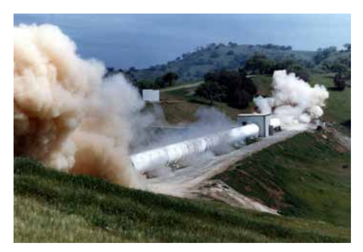
CHES Area 3 with 2.4-m-diameter (8-ft) shock tube.

Underground tests were expensive and infrequent. To study nuclear effects more efficiently, Poulter Lab pioneered the development of aboveground explosive techniques to study nuclear airblast and ground shock effects. Sheet explosive was characterized and used to simulate X-ray loading on reentry vehicle shells. The High Explosive Simulation Technique (HEST) was vastly improved by modeling the expansion of the detonation products and the ground shock loads produced in the process. In the 1980s Poulter Lab designed every significant HEST simulator for large DNA [Defense Nuclear Agency] field tests. Underwater nuclear shocks were also simulated with explosive charges. In 1975 the lab built its first underwater test pool (30 feet square and 20 feet deep) at Area 2 for conducting underwater shock tests on submarine models. Far-field, low-pressure nuclear airblast was simulated in shock tubes. The culmination of this work was the construction and operation of an 8-foot-diameter shock tube at Area 3 driven by 100 lb of explosive.