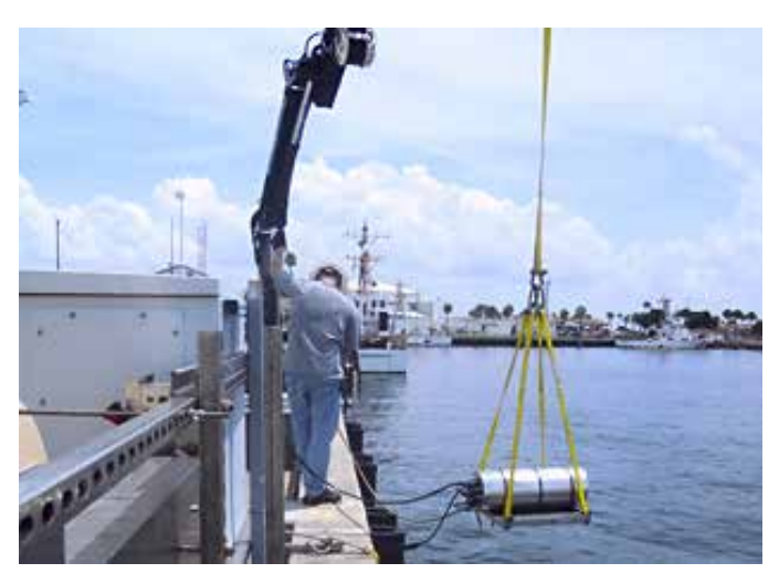
MIMS device being deployed over the sea wall in Bayboro Harbor at the SRI St. Petersburg facility.

The collaboration with Spyglass is expected to extend the impact of the MIMS device in water-intensive industries.